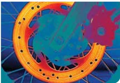
Motorcycle disc brake system